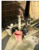
Environmental and health effects of toxic elements, metal ions, and minerals